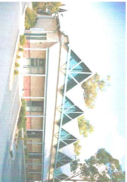
The "Learning Exchange"